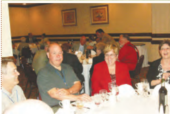
Camaraderie, Learning and Fun!