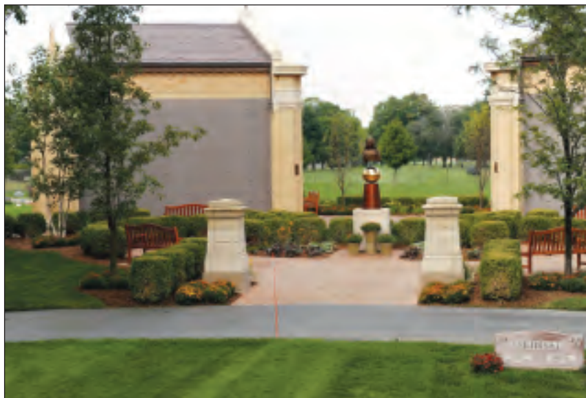
Entrance to Our Lady of Sorrows at Cedar Grove