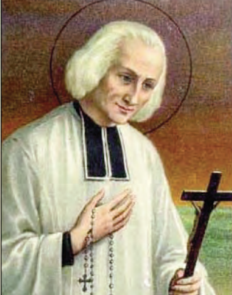
St. John Vianney, Patron of Priests